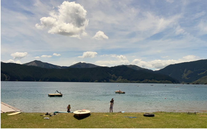
2022/2023 summer shot from Jerdan's Bay, Port Underwood